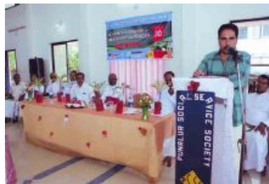
Inauguration of “Jaivagramam”