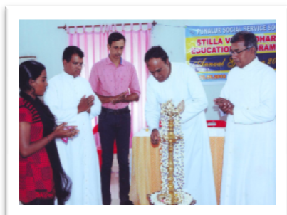
Annual Gathering Inauguration