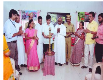
Awareness for SPC Students Children's Day Rally at Mullumala CSD Programme Inauguration