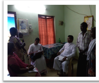
By Director and Coordinator