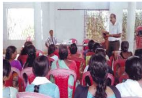
Training in Advocacy and Lobbying