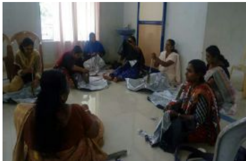
IGP Training in Umbrella Makin

People With Disabilities are mostly the marginalized of the marginalized. It is not that people ignore them but rather the case of people not even ‘thinking’ about them. Disability (does not) affects not only single a person but rather the whole family. The project ‘Advocacy programme for the Federation of People With Disability’ aims to enable Persons With Disability/families to access regular services and opportunity so that they can maximize their physical and mental abilities and become active contributors to the community and society. To achieve this aim, we apply the strategy like networking advocacy and lobbying, skill upgradation training making them as change agents of themselves.